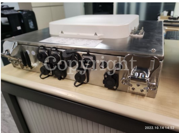
RFID sensing system (Custom made by HKC)